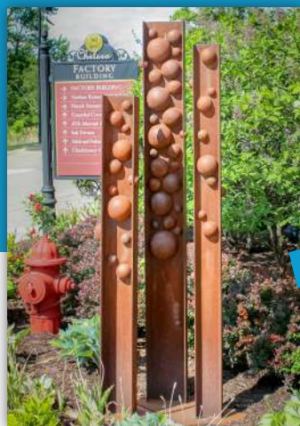
"Contagious" Todd Kime Steel